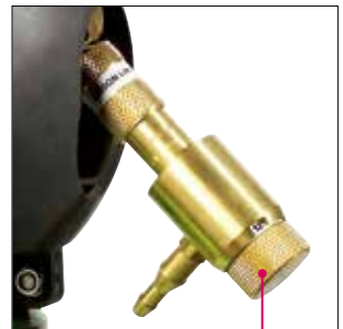
Product code: 302005